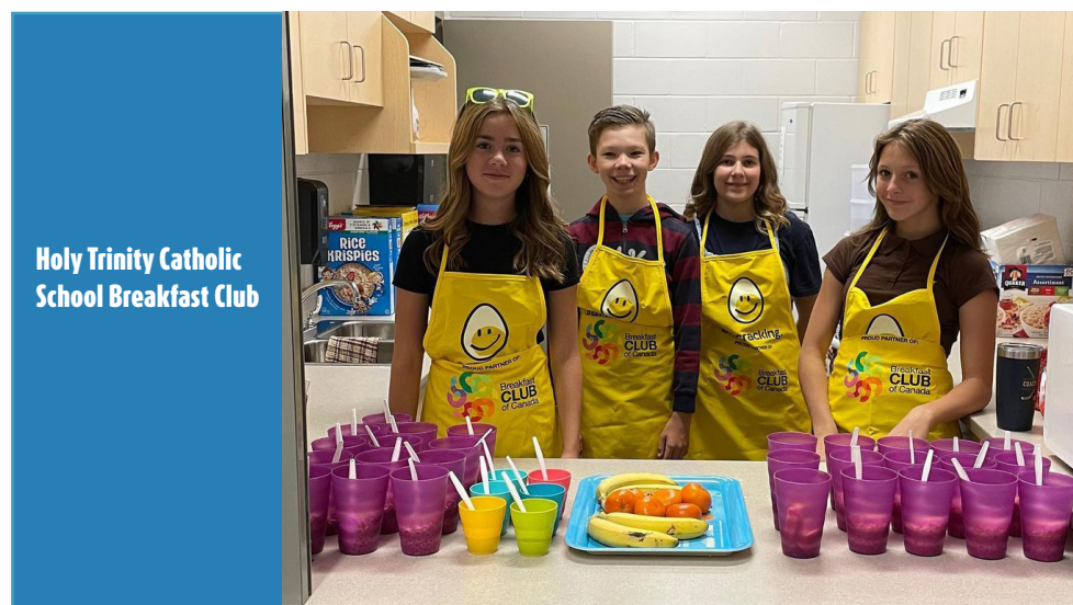
Holy Trinity Catholic School Breakfast Club

We have a variety of needs in the school that some of the families cannot meet. We do not have a Mustard Seed organization that supports our school, so we need to develop different ways to support students' needs. We aim for all students who require breakfast to start the day with something in their bodies. We would also like to start to have lunches available for students and backpacks to go home with students at the end of the day once or twice a week. We have a number of families in need in our school community.