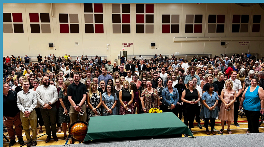
New staff are welcomed at the RDCRS Division Opening Celebration.

Jesus' whole approach to teaching was marked by a deep engagement with people's everyday lives and favouring those who most need it. This will serve as our model and inspiration.