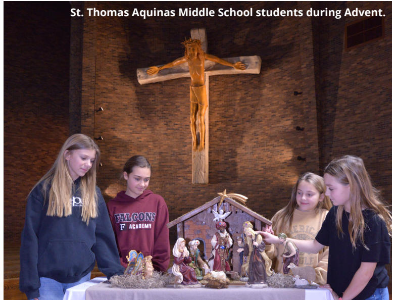
St. Thomas Aquinas Middle School students during Advent.

The second objective is a four-year focus on intentional permeation. We will continue to help students see the world through a 'Catholic lens.' As they are immersed in curricular content, we will strive to challenge our students to critically examine their learning with these core characteristics as the filter.