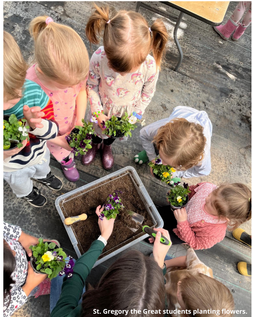
St. Gregory the Great students planting flowers.

While this indicates a slight increase, we need to continue to develop the connection between curricular outcomes and our faith.