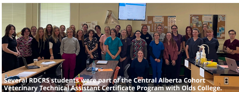
Several RDCRS students were part of the Central Alberta Cohort Veterinary Technical Assistant Certificate Program with Olds College.