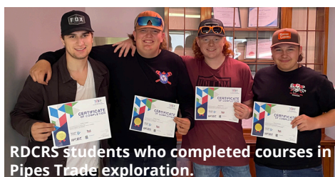
RDCRS students who completed courses in Pipes Trade exploration.