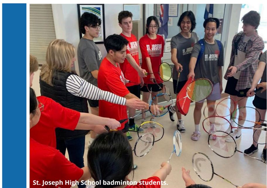
St. Joseph High School badminton students.

The challenges of COVID-19 continued to impact classrooms in the Division. This impacted what data was gathered to support and inform the Division’s work, including the planning and reporting cycle. Specifically, longitudinal data became problematic as comparisons were not available and processes were re-employed that had been paused for the pandemic. The Division feels this has had an impact on results in some key areas.