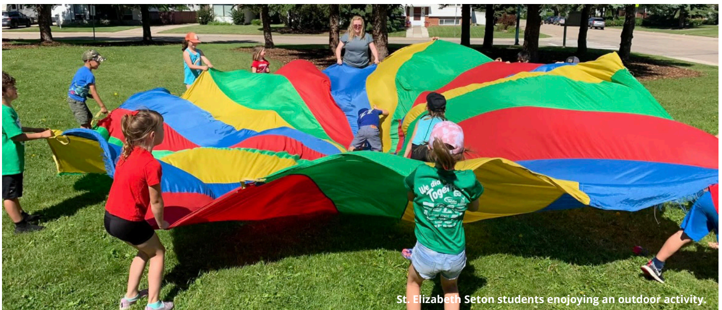
St. Elizabeth Seton students enjoying an outdoor activity.

The parent culture survey questions were newly implemented for this year, longitudinal data will be compiled over time.