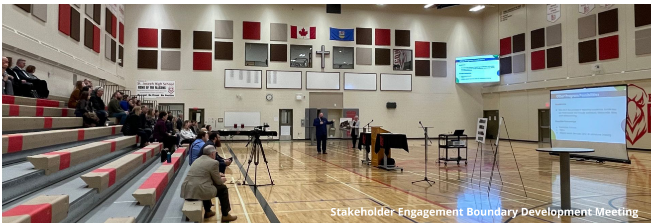
Stakeholder Engagement Boundary Development Meeting