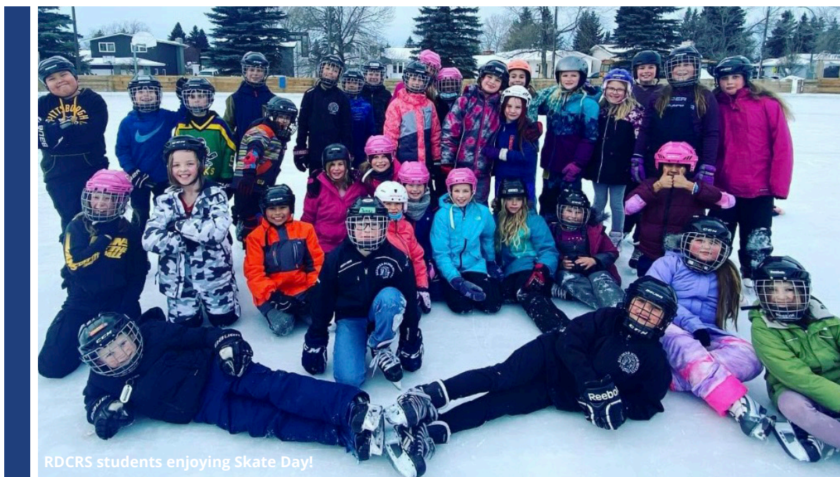
RDCRS students enjoying Skate Day!

Agree that students have access to the appropriate supports and services at school.