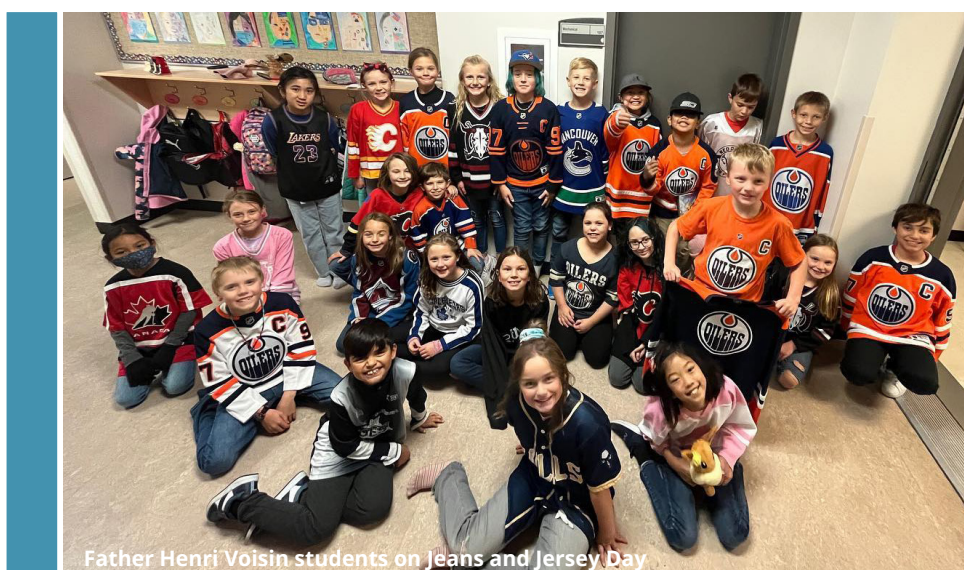
Father Henri Voisin students on Jeans and Jersey Day

Using focused areas of improvement within elementary, middle and high school classrooms, all teachers are required to design classroom opportunities that address individual learning needs, which will ultimately move the Division away from a 'one-size-fits-all' pedagogical approach. Starting with the student's learning needs first, then building towards addressing subject and grade curriculum outcomes in the provincial Program of Studies, will develop a student-first approach to learning that will lead to optimized student success.